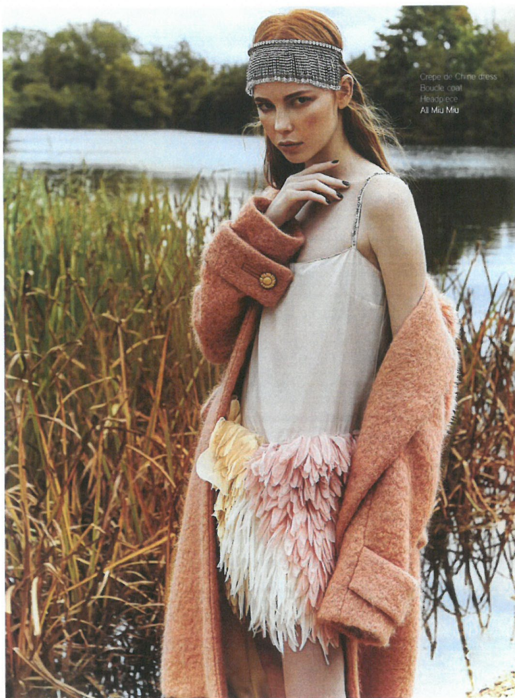
Crepe de Chine dress Boucle coat Headpiece All Miu Miu