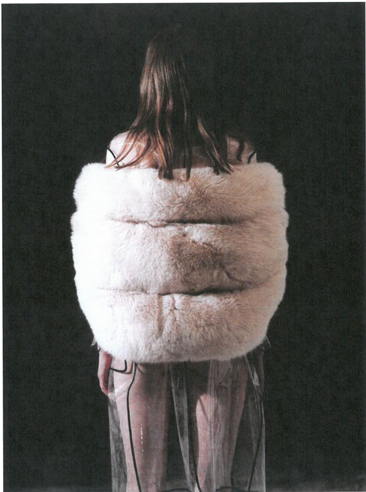
GERMANIA-NUMÉRO BERLIN-MIU MIU-AUTUMN WINTER-2017