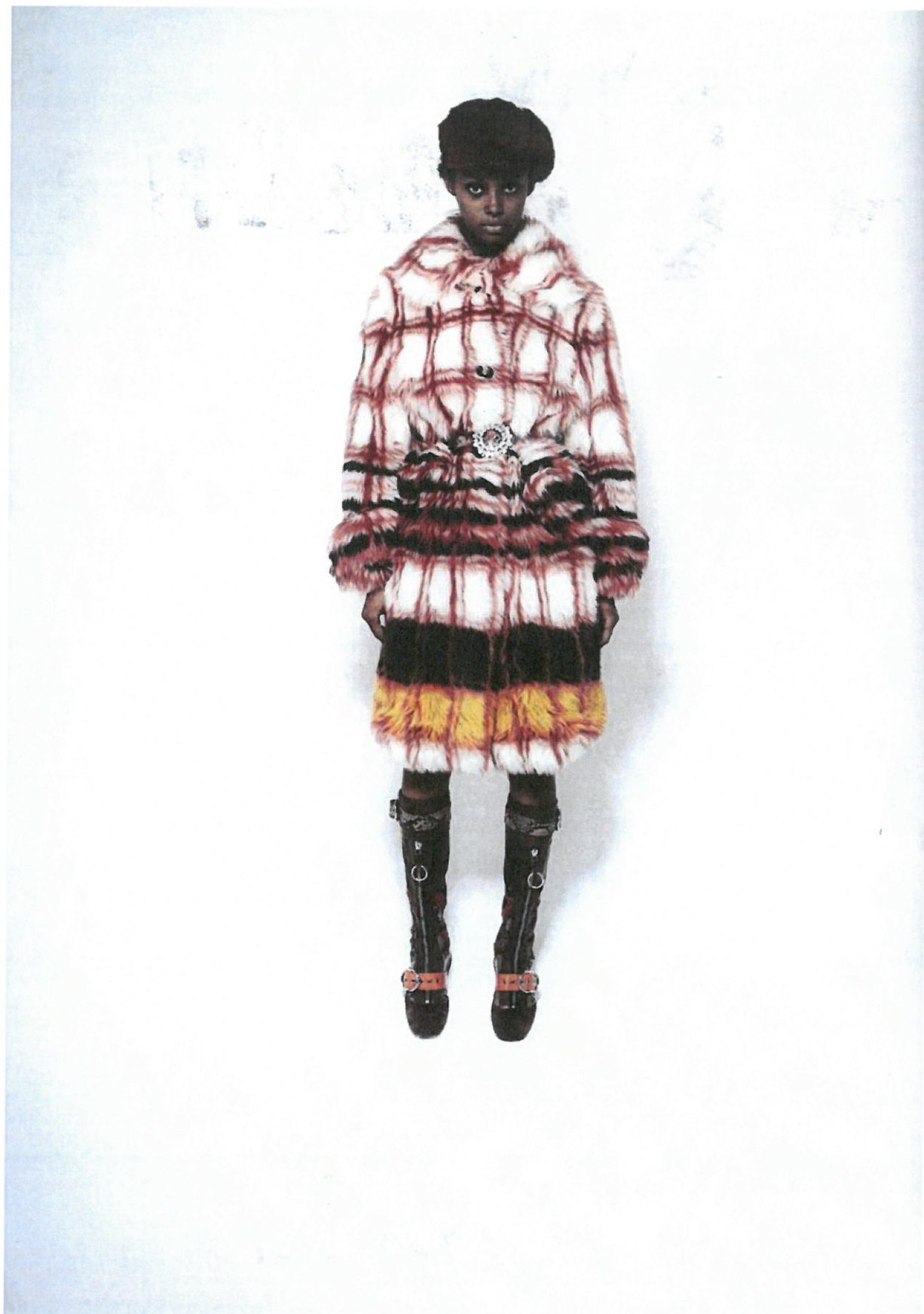
GERMANIA-NUMÉRO BERLIN-MIU MIU-AUTUMN WINTER-2017